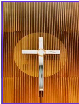
Distinguished Cross & Crown